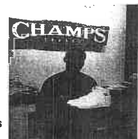
Customer Service CHAMPS

Adult Face to Face Educational Contacts EARN Center: 421