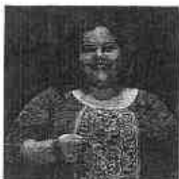
Administrative Assistant Chester County Legal Aid

2013—2014 Educational Year (Oct. 2013—Sept. 2014)