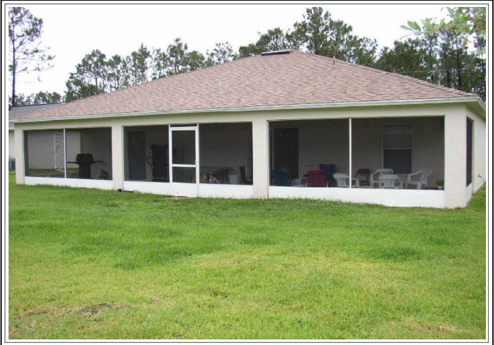
REAR VIEW OF SUBJECT PROPERTY

Appraised Date: September 1, 2023 Appraised Value: $ 220,000