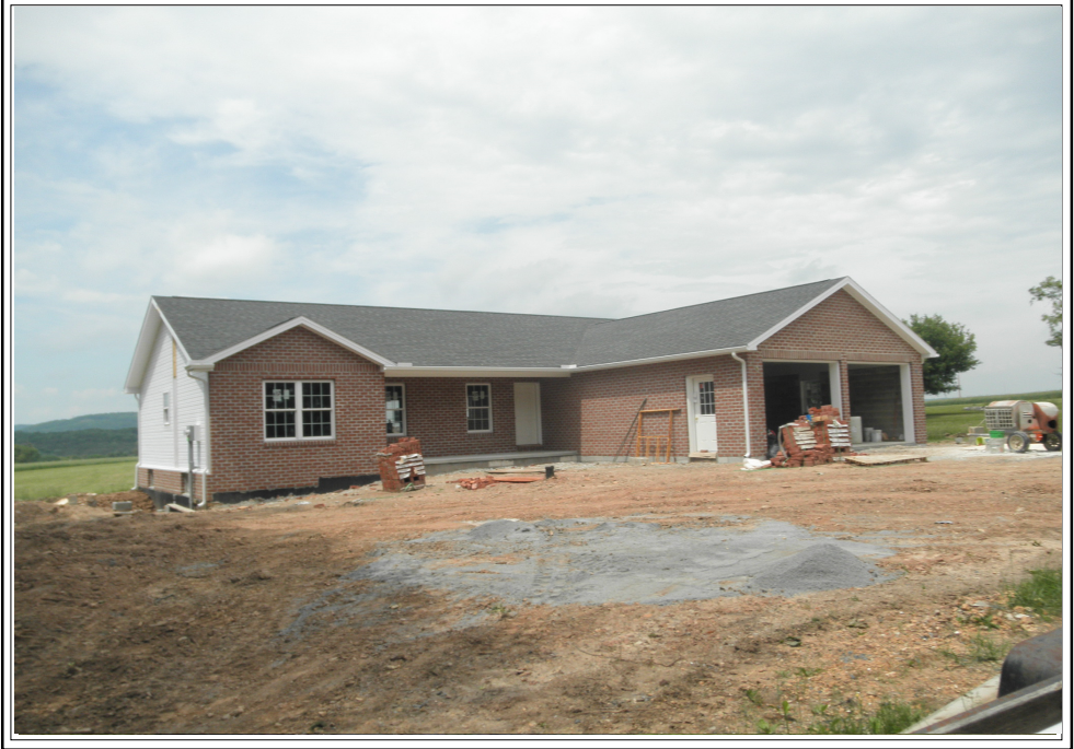
FRONT VIEW OF SUBJECT PROPERTY

Appraised Date: September 1, 2023 Appraised Value: $ 220,000