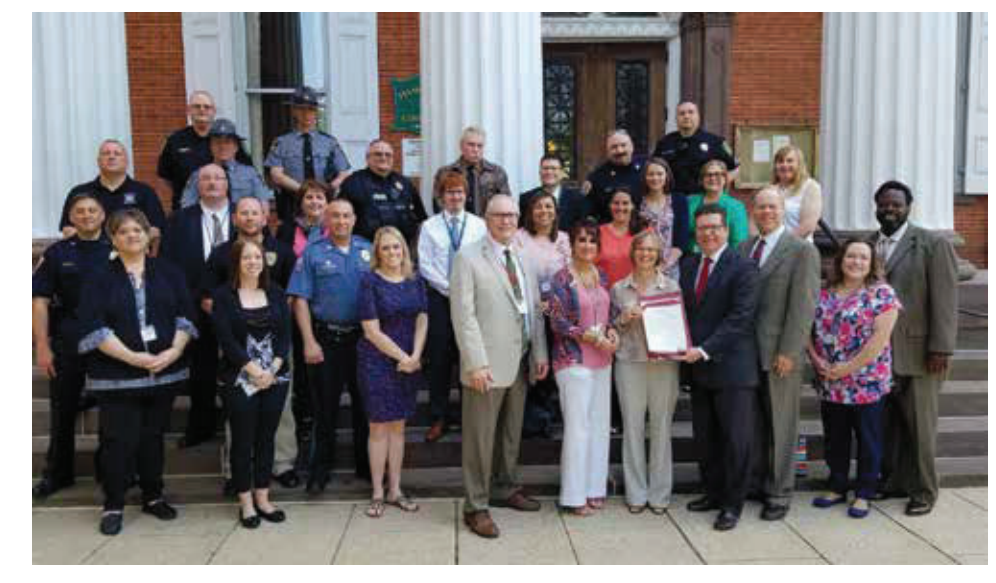
May 8, 2018—Each May, the Franklin County commissioners proclaim a Franklin County Stepping Up Day of Action to bring awareness to the efforts being made to connect people to treatment and services in lieu of incarceration.

The Case Assisted Re-Entry (CARE) jail diversion program provides screening, risk assessment, case management and support to individuals who have a mental health disorder who are involved in the criminal justice system.